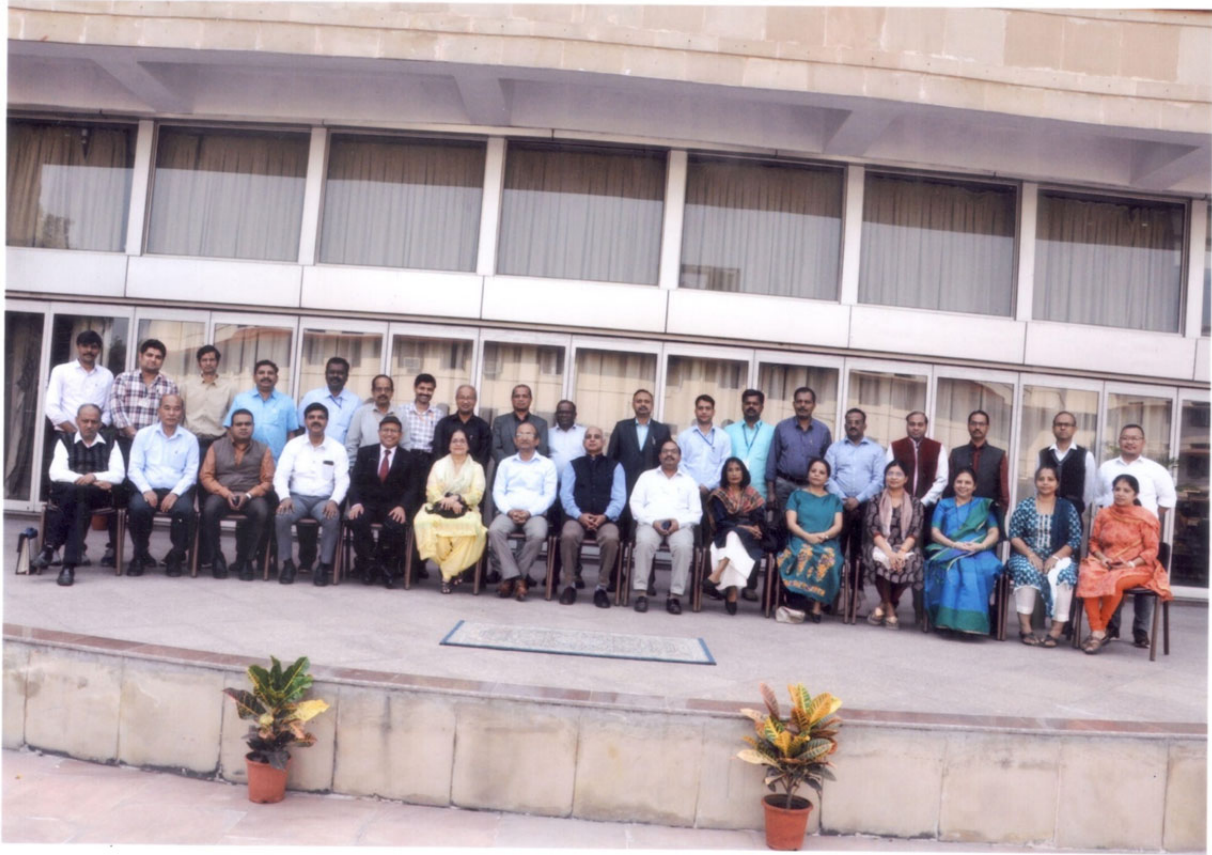
A glimpse of workshop organized for the Officers of State Public Service Commissions on “Recruitment Rules” and “Recruitment under persons with disabilities” during 10th – 11th November, 2022 in the premises of UPSC.