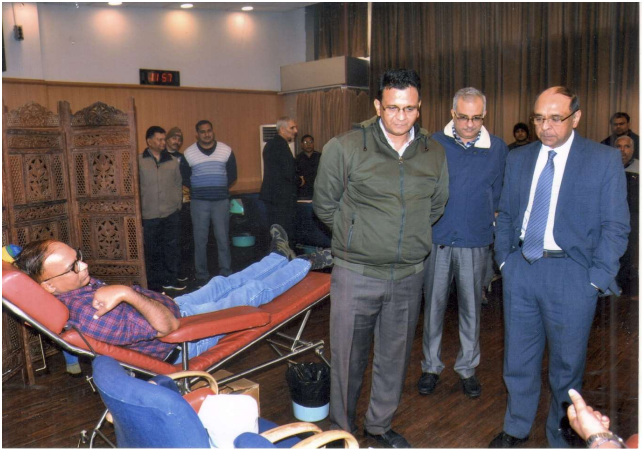
An in-house Blood Donation Camp was organized in collaboration with the Indian Red Cross Society on 08.01.2020 in the premises of the Commission.