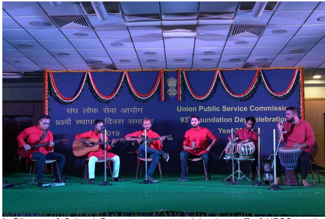
A Glimpse of Cultural Programme presented by the staff of UPSC on the occasion of 93<sup>rd</sup> Foundation Day of UPSC held on 1st October 2019.