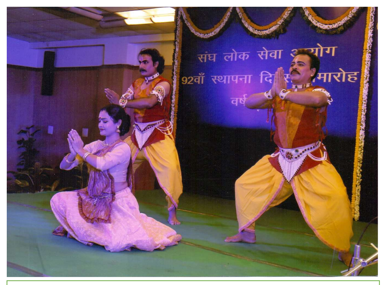
A Glimpse of Cultural Programme presented by the staff of UPSC on the occasion of 92<sup>nd</sup> Foundation Day of UPSC held on 1<sup>st</sup> October, 2018.