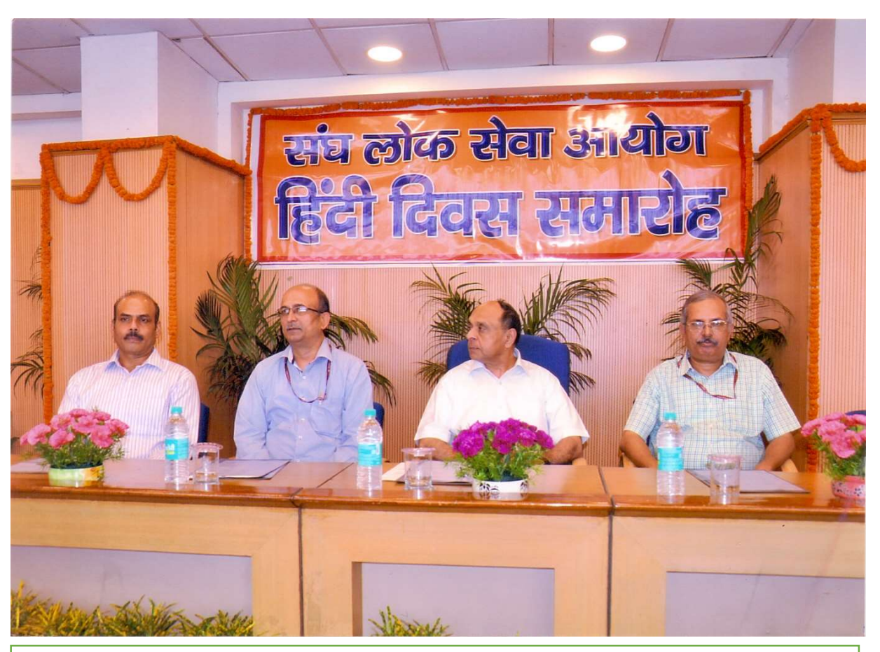
Celebration of "Hindi Diwas" held in the Commission on 17th September, 2018.