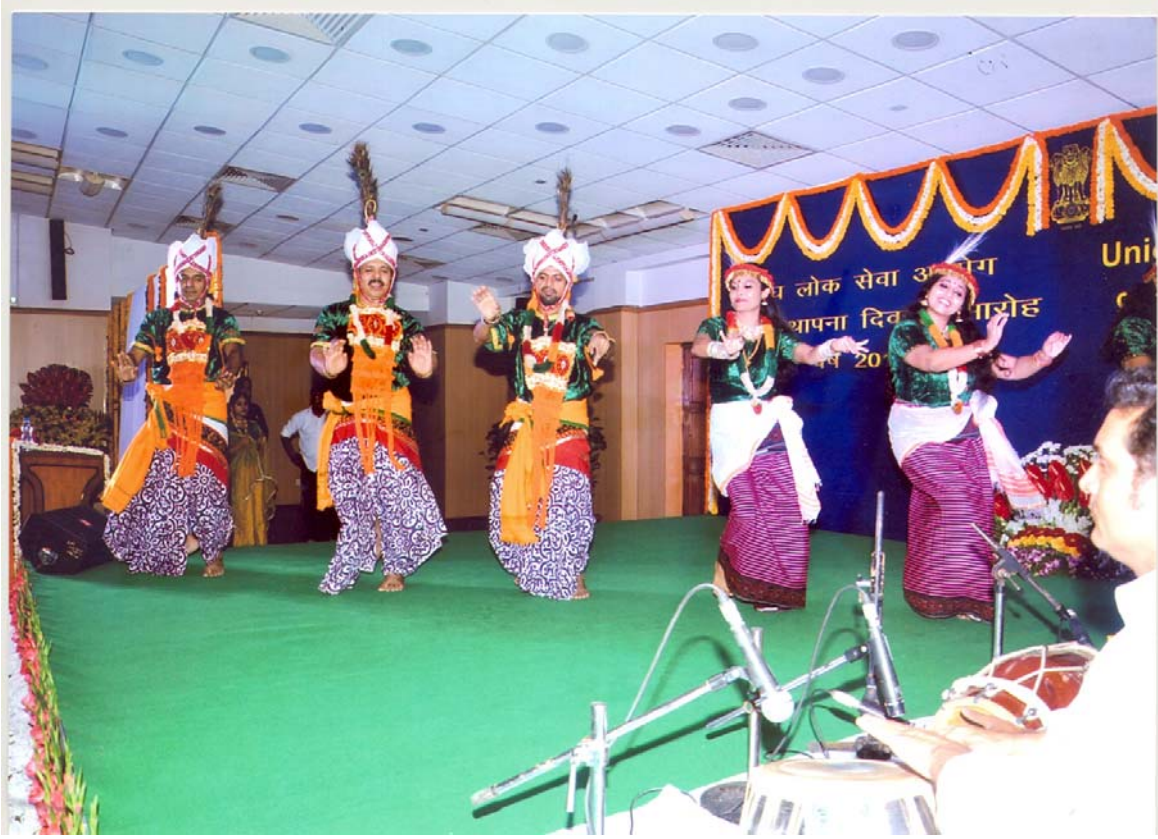
A Glimpse of Cultural Programme presented by the staff of UPSC on the occasion of 90 th Foundation Day of UPSC held on 30 th September, 2016